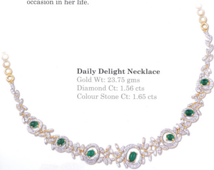
Daily Delight Necklace Gold Wt: 23.75 gms Diamond Ct: 1.56 cts Colour Stone Ct: 1.65 cts