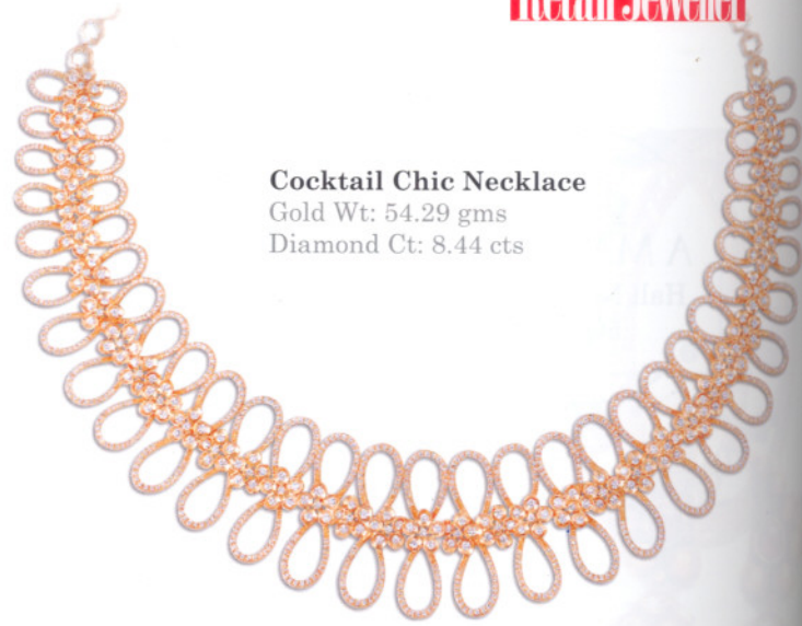
Cocktail Chic Necklace Gold Wt: 54.29 gms Diamond Ct: 8.44 cts

A'Star Jewellery unveils an exciting range of neckwear which exemplifies the five basic styles which are quintessential to every woman's wardrobe. The collection, aptly named, 'Neck Sparklers – My 5 essentials', offers over 100 designs. The five styles – namely Sparkle@ Sixteen, Daily Delight, Classic Cool, Cocktail Chic and Wedding Wow complement every occasion in her life.