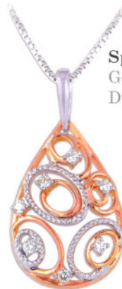
Sparkle @ Sixteen Pendant Gold Wt: 3.35 gms Diamond Ct: 0.15 cts