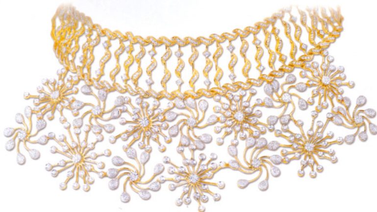
Wedding Wow Necklace Gold Wt: 92.71 gms Diamond Ct: 7.32 cts