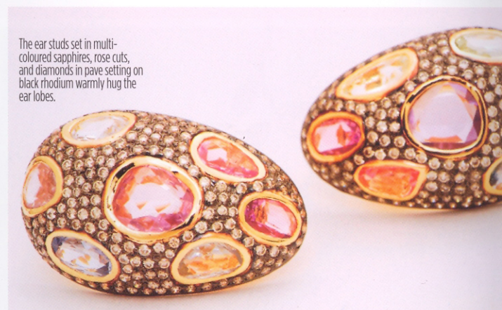
The ear studs set in multi-coloured sapphires, rose cuts, and diamonds in pave setting on black rhodium warmly hug the ear lobes.