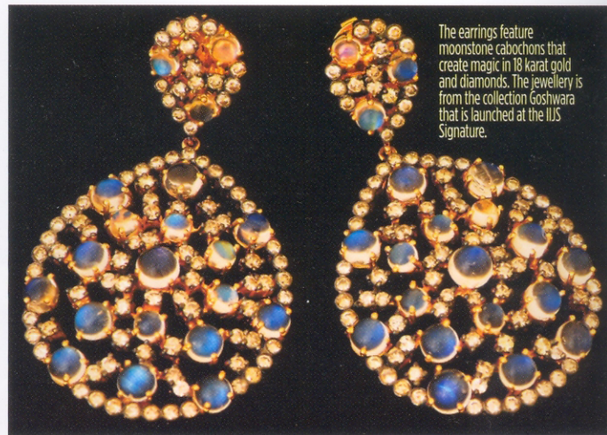
The earrings feature moonstone cabochons that create magic in 18 karat gold and diamonds. The jewellery is from the collection Goshwara that is launched at the IJS Signature.