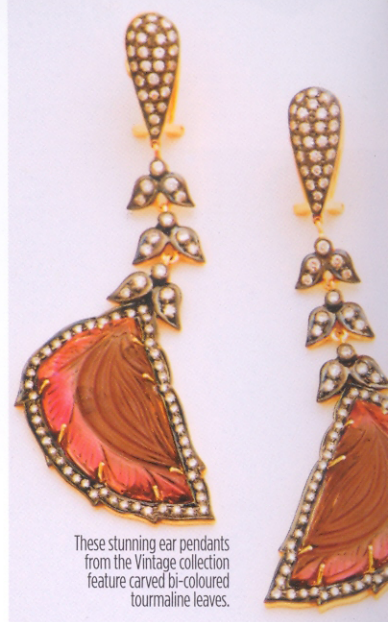
These stunning ear pendants from the Vintage collection feature carved bi-coloured tourmaline leaves.

Exclusive designs are the firm's forte. Each jewellery piece is skilfully handcrafted by the best of artisans and manufactured with high quality control standards.