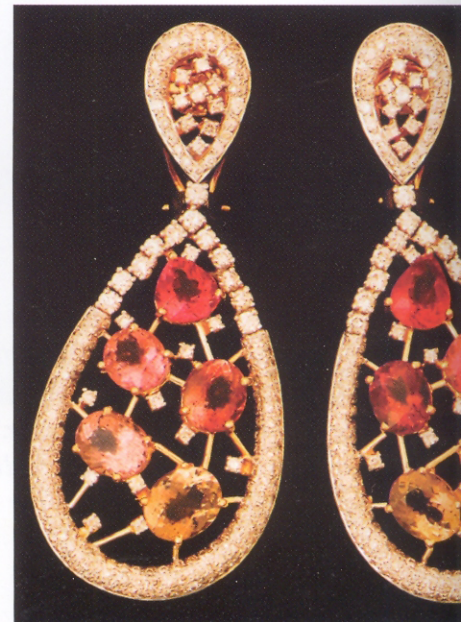
These dangles have multi coloured oval cut tourmalines arranged like constellations in 18 karat gold and diamonds.