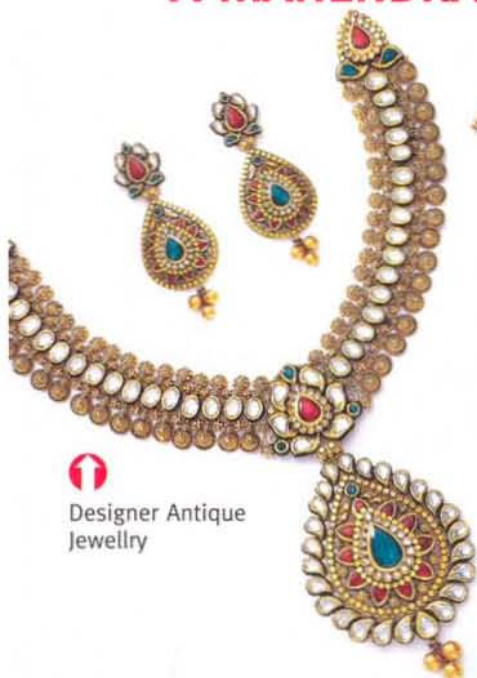
Designer Antique Jewellery