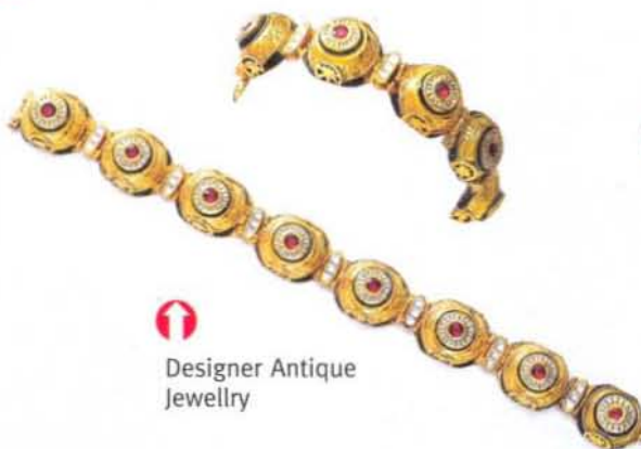
Designer Antique Jewellery