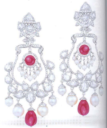
For the Traditionalist CLASSIC & TIMELESS Gold Wt: 34.10 gms Diamond Ct: 7.11 cts Colour Stone Ct: 42.66 cts