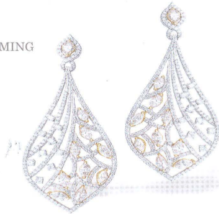
For the Sophisticate ELEGANT & STYLISH Gold Wt: 18.95 gms Diamond Ct: 6.55 cts