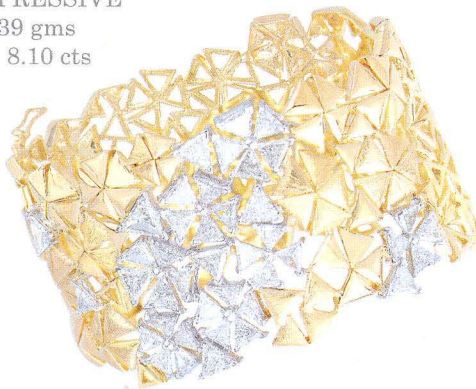
For the Charismatic BOLD & EXPRESSIVE Gold Wt: 44.39 gms Diamond Ct: 8.10 cts