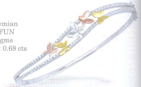
For the Bohemian QUIRKY & FUN Gold Wt: 15 gms Diamond Ct: 0.68 cts