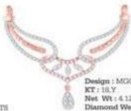
Design : MG001185 KT : 18.Y Net Wt : 4.12 GMS Diamond Weight : 0.67 CTS