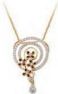
GOLD WT: 3.37 GMS DIAMOND CT: 0.62 CTS

Email: sales@astarjewellery.com | Website: www.astarjewellery.com