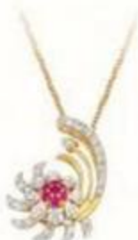
GOLD WT: 3.13 GMS DIAMOND CT: 0.30CTS