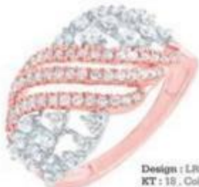
Design : LR001963 KT : 18. Color : P Net Wt : 11.834 GMS Diamond Weight : 3.27 CTS