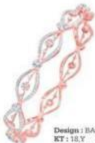
Design : BA001013 KT : 18.Y Net Wt : 11.834 GMS Diamond Weight : 3.27 CTS

E- 9011/12 Bharat Diamond Bourse Internal Rd, 400051, G Block BKC, Bandra Kurla Complex, Bandra East, Mumbai, Maharashtra 400051