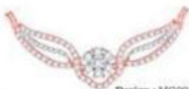
Design : MG001169 KT : 18.Y Net Wt : 3.25 GMS Diamond Weight : 0.52 CTS