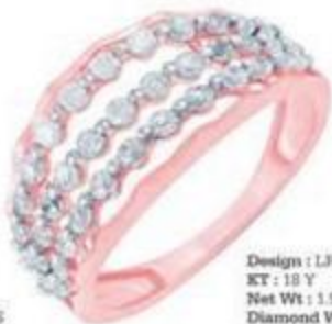
Design : LR001586 KT : 18.Y Net Wt : 1.983 GMS Diamond Weight : 0.69 CTS