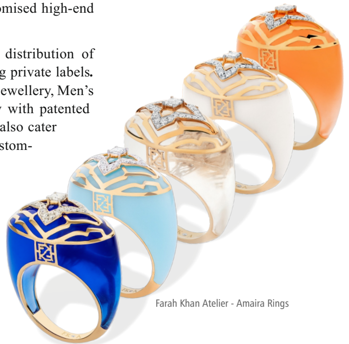
Farah Khan Atelier - Amaira Rings

At the heart of Asian Star's business strategy lays the sincerity of always putting our customers first, and the passion of creating customer experiences that are personal, positive and beyond expectations.