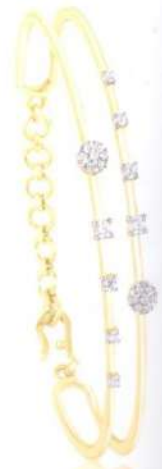
Design code: AOB00594 Gold Wt: 9.15gms Diamond Ct: 0.29cts

Exquisitely minimalist and effortlessly chic, our collection of pendants, earrings, rings, and bracelets offers a fusion of style and functionality, making it the perfect accessory for everyday adornment.