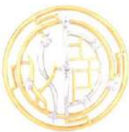
Design code: AE014082 Gold Wt: 5.89gms Diamond Ct: 0.18cts