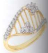
Design code: AR020484 Gold Wt: 2.95gms Diamond Ct: 0.23cts