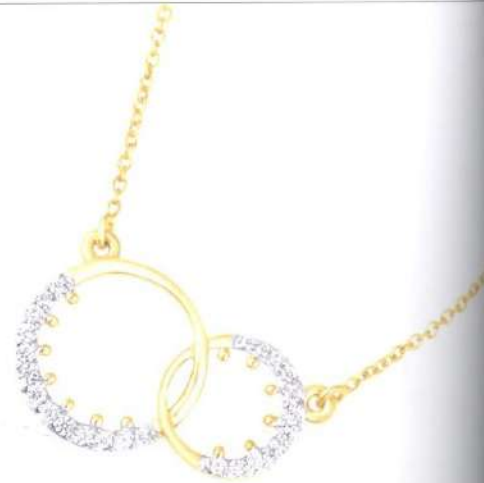
Design code: AP006863 Gold Wt: 3.18gms Diamond Ct: 0.14cts

A fusion of human spirit of optimism and the captivating allure of natural and geometric inspirations, A'Star Jewellery's new collection promises to captivate and delight at IIJS Premiere 2023.