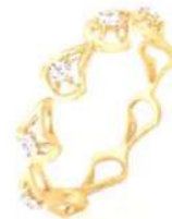
Design code: AR020485 Gold Wt: 1.58gms Diamond Ct: 0.09cts