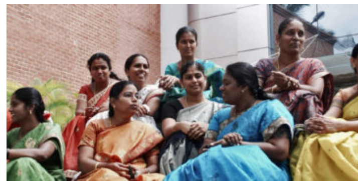
WDC Members Making a Difference: A diamond manufacturer living by the maxim of Mahatma Gandhi