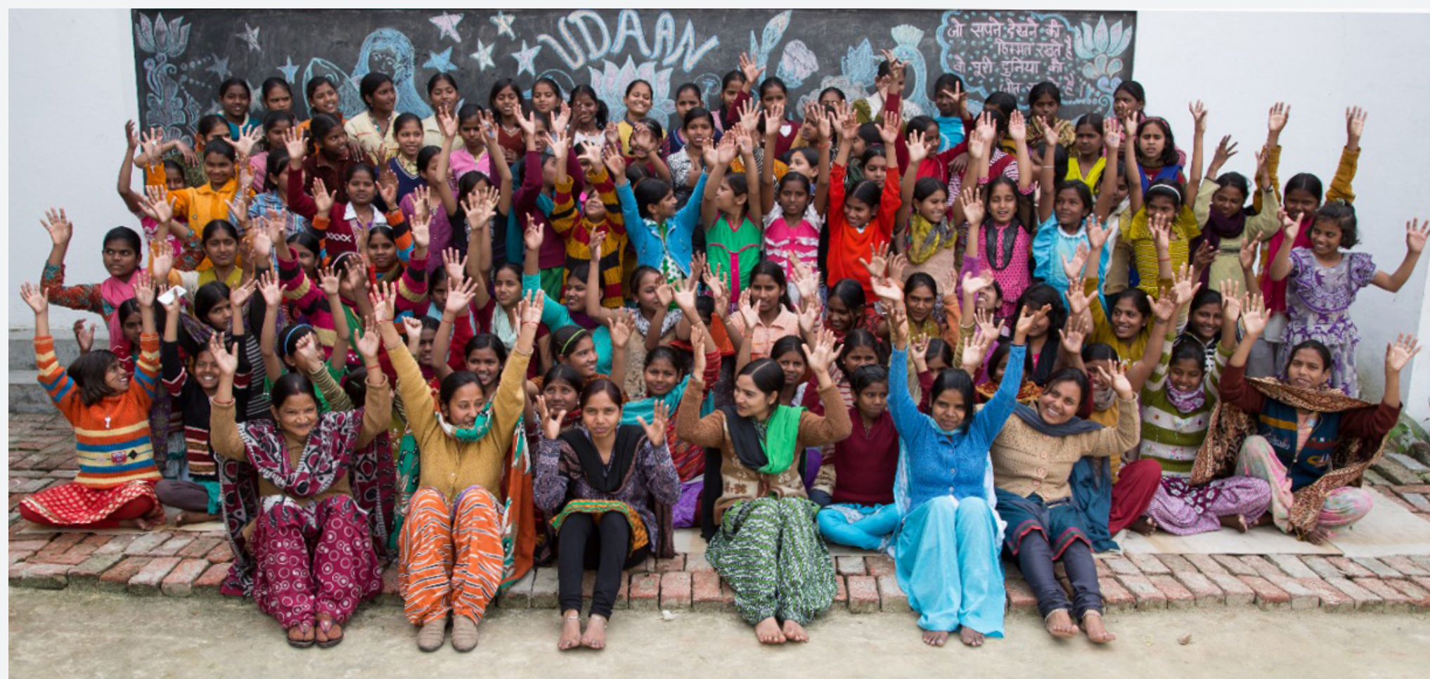
Underprivileged adolescent girls, all benefiting from CARE India's Udaan educational project, which is funded by Asian Star's Aatamdeep Trust.

'It is not how much we give, but how much love we put into giving' – Mother Theresa