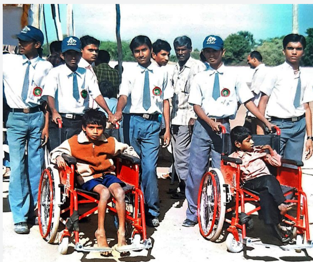
Asian Star staff on an outing organized to benefit physically and cognitively challenged children in the community.

It is all part of the company's mission to create a better tomorrow, where those who are underprivileged today receive the opportunities that will allow them to thrive and prosper in the future.