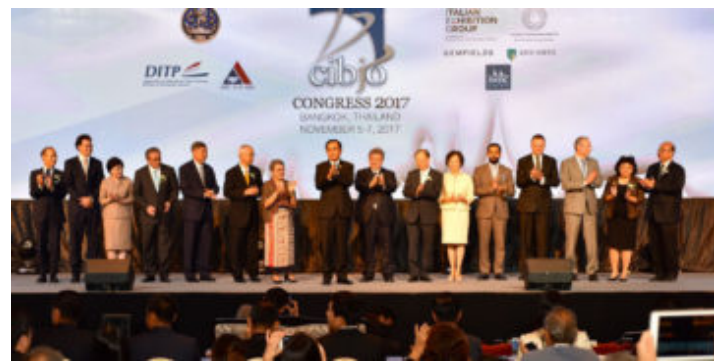
WDC Members Making a Difference: CIBJO promotes industry's role as initiator of sustainability