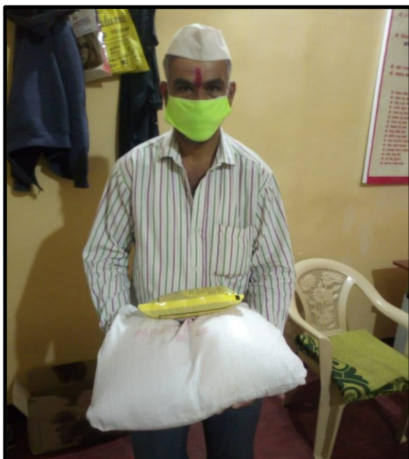
Food for those who served us. (The Mumbai Dabbawallas)