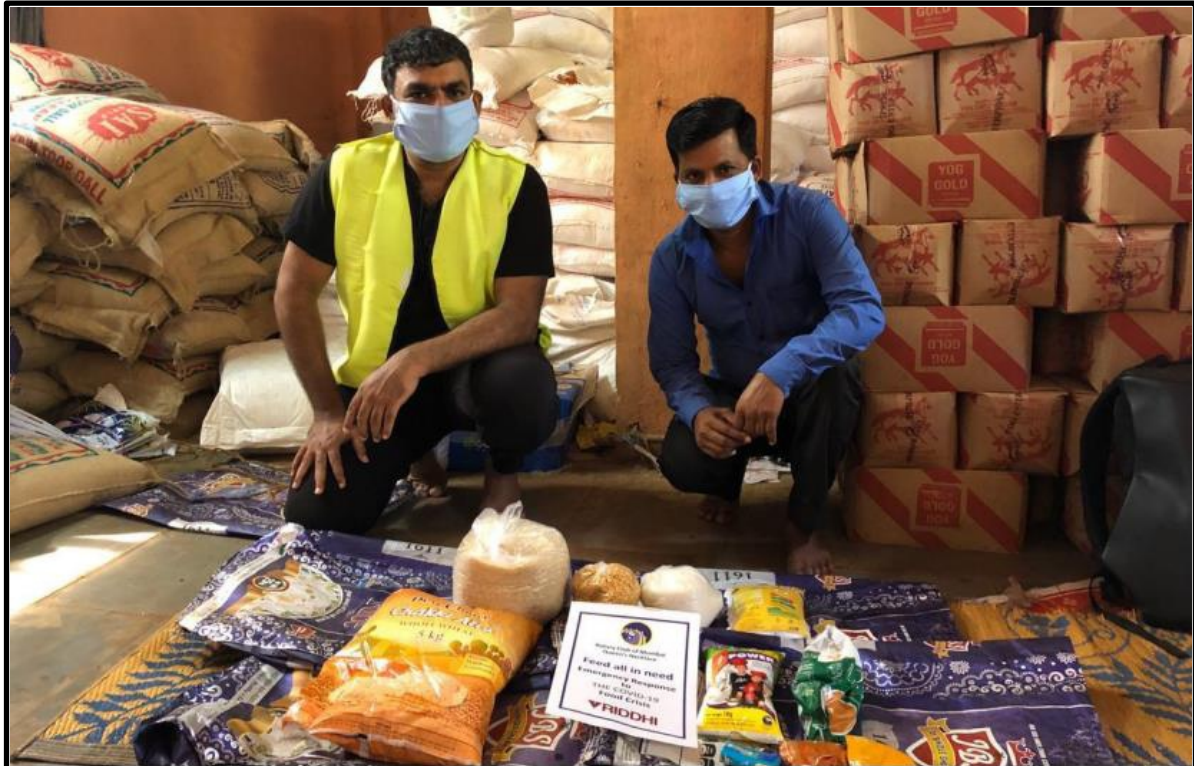
The Rotary Club Warriors at work.