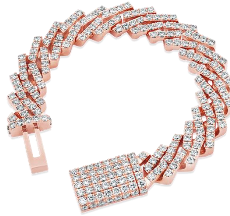
URBANE Men's Jewellery